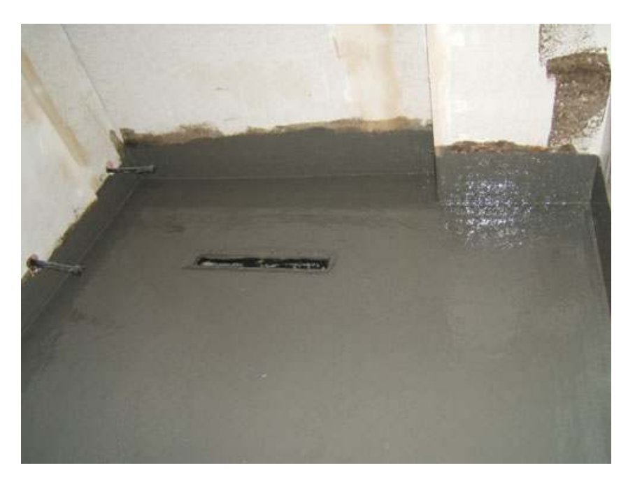
Above: GRP Wet Room System installed.

We now offer a GRP Wet Room System, which is ideally suited to waterproof sub floors prior to tiling.