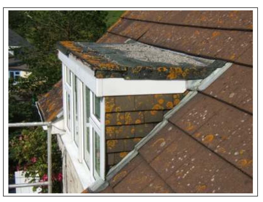
Above, The original felt covering has deteriorated and leaking badly.