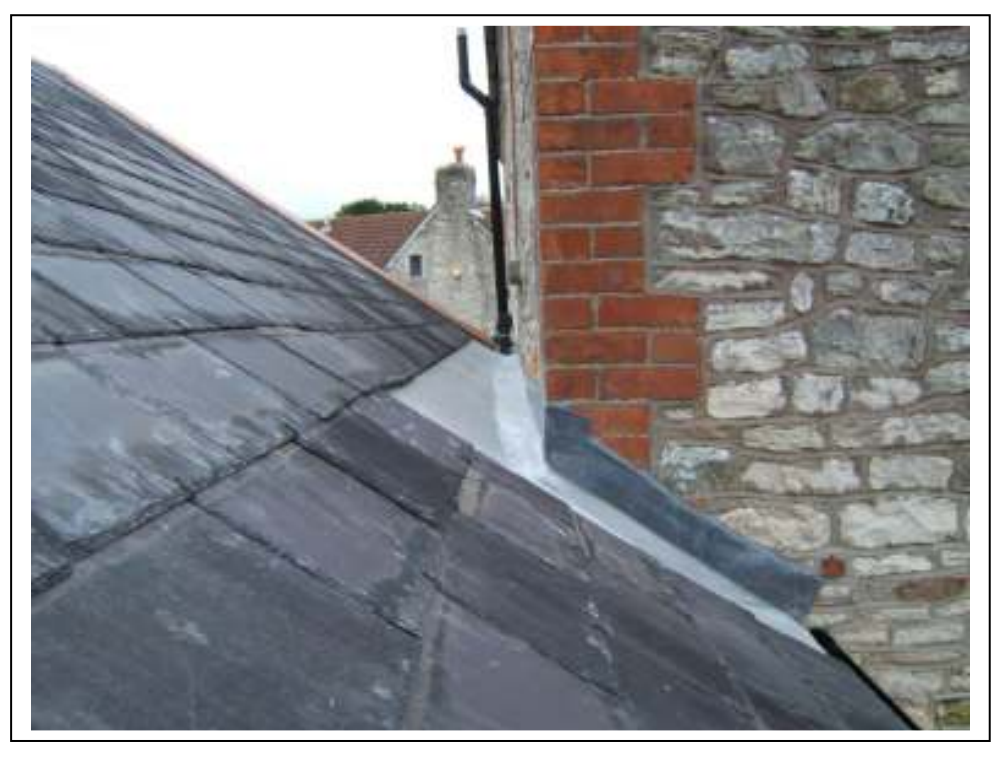
Above: an awkward back gutter abutment

One of G.R.P.'s greatest properties are that once again, it can easily cope with awkward steps returns, created a seamless watertight seal.